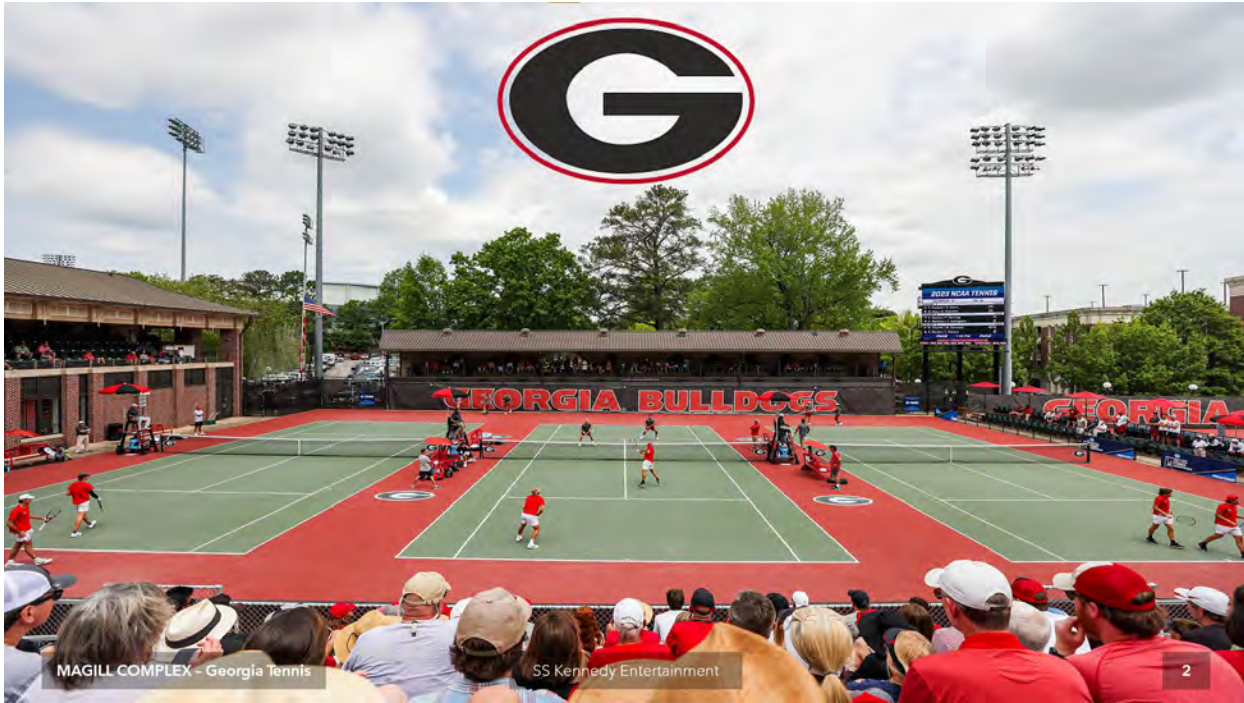
MAGILL COMPLEX - Georgia Tennis