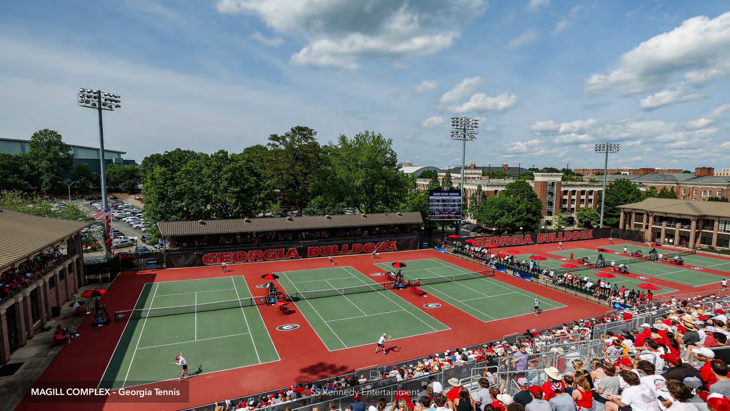
MAGILL COMPLEX - Georgia Tennis